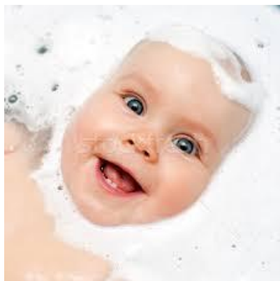
[Name] Tech Operator

NOTE: These people work behind the scenes, so you might not see them. Their photos will be updated closer to the show!