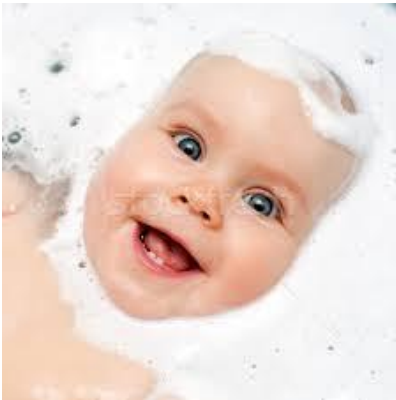
[Name] Tech Operator

NOTE: These people work behind the scenes, so you might not see them. Their photos will be updated closer to the show!